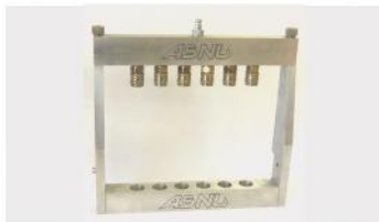
Siemens Fuel Rail