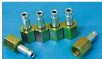
Siemens Coupling (QTY 6)