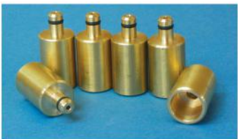
Bosch Coupling (QTY 6)