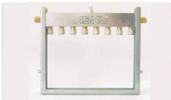
Bosch Fuel Rail